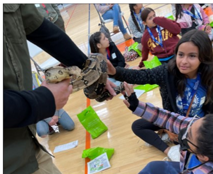
Girls have a hands-on lab with live reptiles—including this snake—while they learn about their physiology, habitat and behavior.