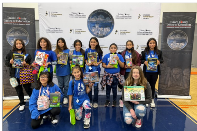
Our Branch has made it possible for Goshen Elementary School girls to attend EYH for two decades. These happy STEM students have earned take-home lab kits, to keep their interest kindled long after the day-camp experience.

Our contribution made it possible for 50 additional girls to get in on this inspiring event. We also subsidized the take-home lab kits that were awarded to the students whose "tweets" (pithy "posts" describing the importance of STEM endeavors to them) were judged the best. These were distributed at the day-end plenary that wrapped up a truly wonderful event.