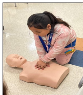
A student practices life-saving CPR technique, in a nursing careers class.