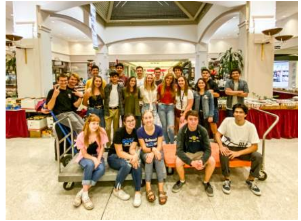
Right: The Redwood FBLA kids who helped unload the trucks and set up the sale.