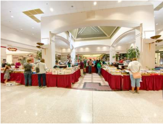
Left: The books on the table!