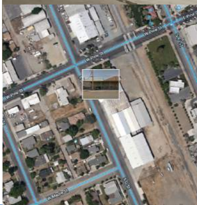
This is what it looks like from the front and the air.