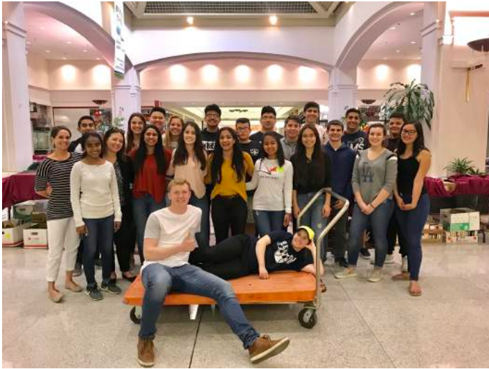
Thank you FBLA students for all your help! Random images from the book sale days.