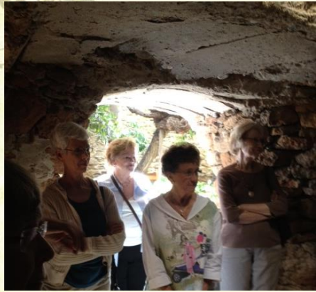
Garden Gals visit Forestiére Gardens